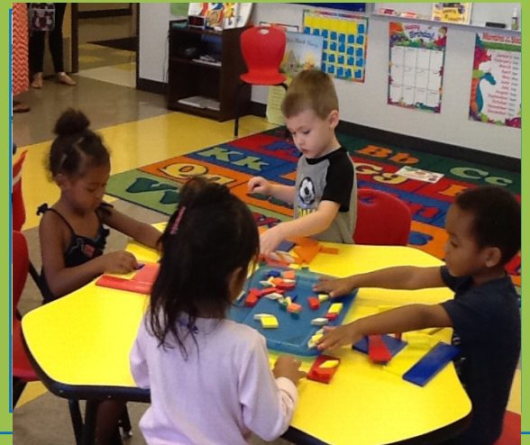
Students in the 3s/4s class work on shape and color matching as they learn about new shapes and improve their fine motor skills.